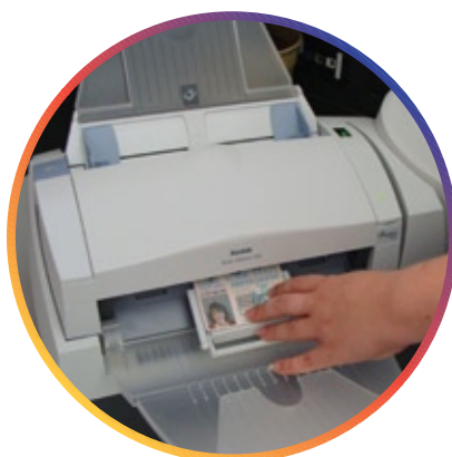
Easily scans hard cards

What's more, Kodak Service and Support professionals are just a phone call away to provide the fast response you need to make sure you're free to do what you do best — run your business for productivity and optimal efficiency.