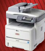
MB400 Series Mono MFP Most Versatility in Black and White