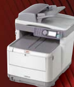
MC360 Color MFP Superior HD Color Output